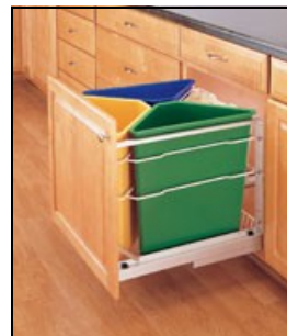
Rev-A-Shelf Recycle Center

We also work with a wide variety of counter-top specialists and have options that range from natural stones such as granite to recycled solid surfaces.