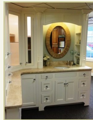
Showroom Bathroom Vanity

tiful marble and highlights an under-mount white porcelain sink.