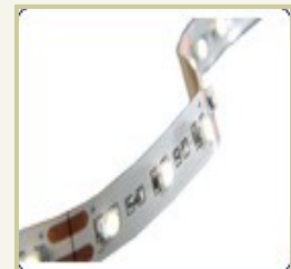
LED Light Strip

Other types of LED lighting, such as pocket lights, are also available.