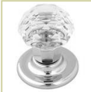
AMEROCK CRYSTAL KNOB

tiful marble and highlights an under-mount white porcelain sink.