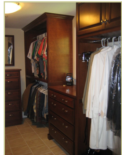
Custom Built Closet