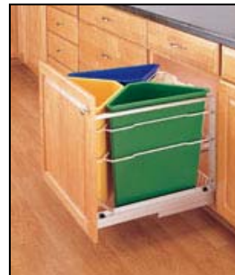
Rev-A-Shelf Recycle Center

We also work with a wide variety of counter-top specialists and have options that range from natural stones such as granite to recycled solid surfaces.