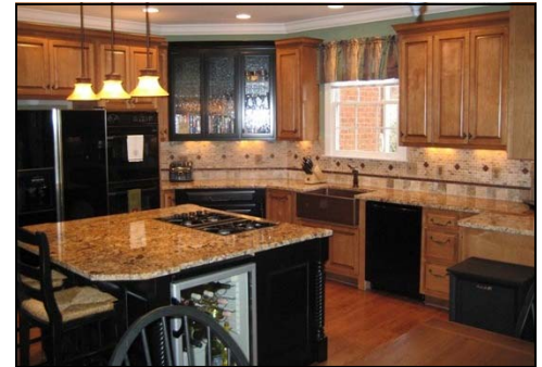
Cross Cabinets: Maple stained with Coffee and glazed with Chocolate accented with Black Distressed